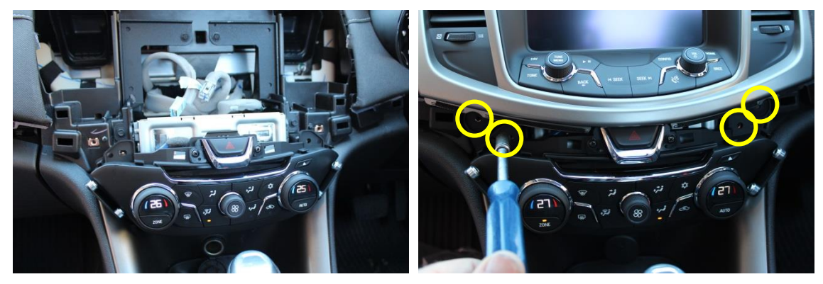
Plug in & re-install A/C control & screen units. Re-screw 4 hex-bolts from step 2