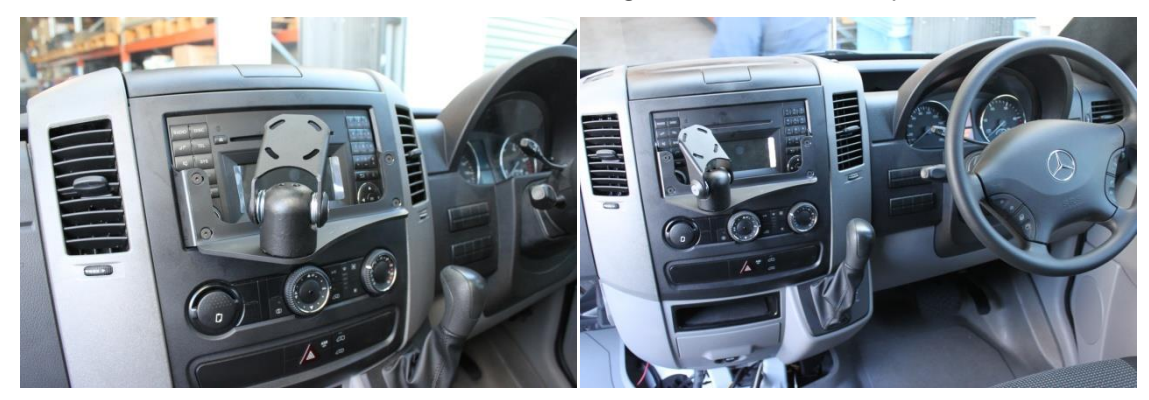
Attach the In-Dash mount bracket using the 4 x black screws provided.

If you have any issues or questions, pleasecontact us. Industrial Evolution