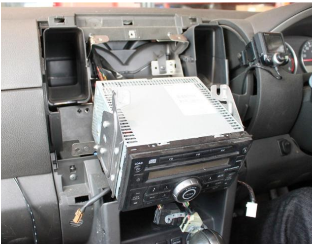
1) Remove stereo from dash

Nissan Pathfinder: In-dash mounting bracket tilt and turn assembly