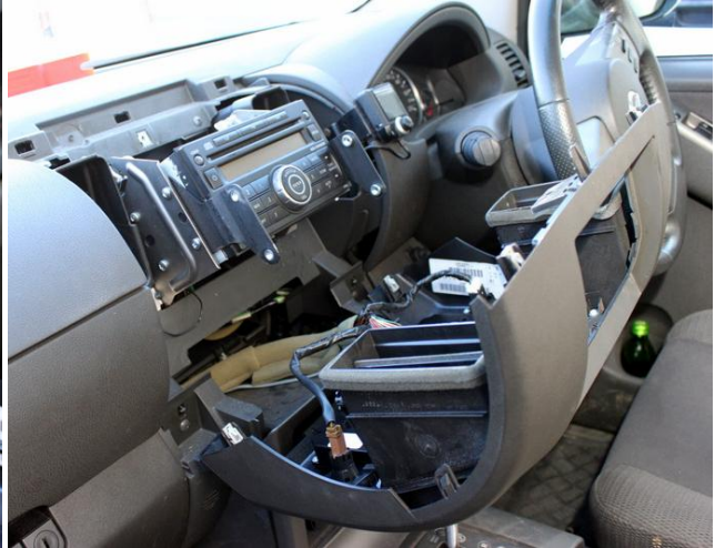
4) Reinstall stereo