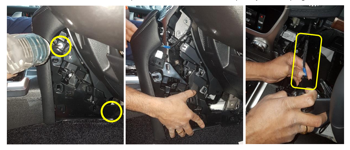
Remove screws so side panels can be removed completely, and unplug cords